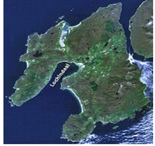
Lochindaal on the Isle of Islay, off Scotland.

The shipwreck on the Island of Islay took place near where other Campbells lived and they helped the family and others to safety and to recover some of their possession.